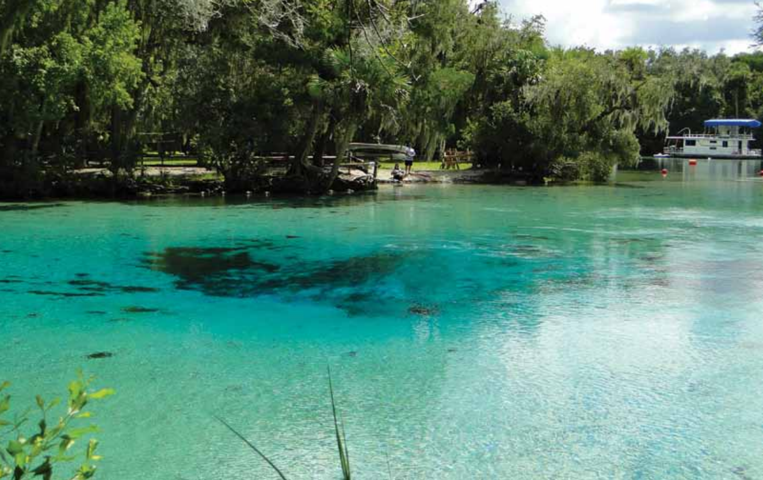
Dark patches of blue signal the entrance to the underground springs that supply the Silver Glen Springs recreation area.