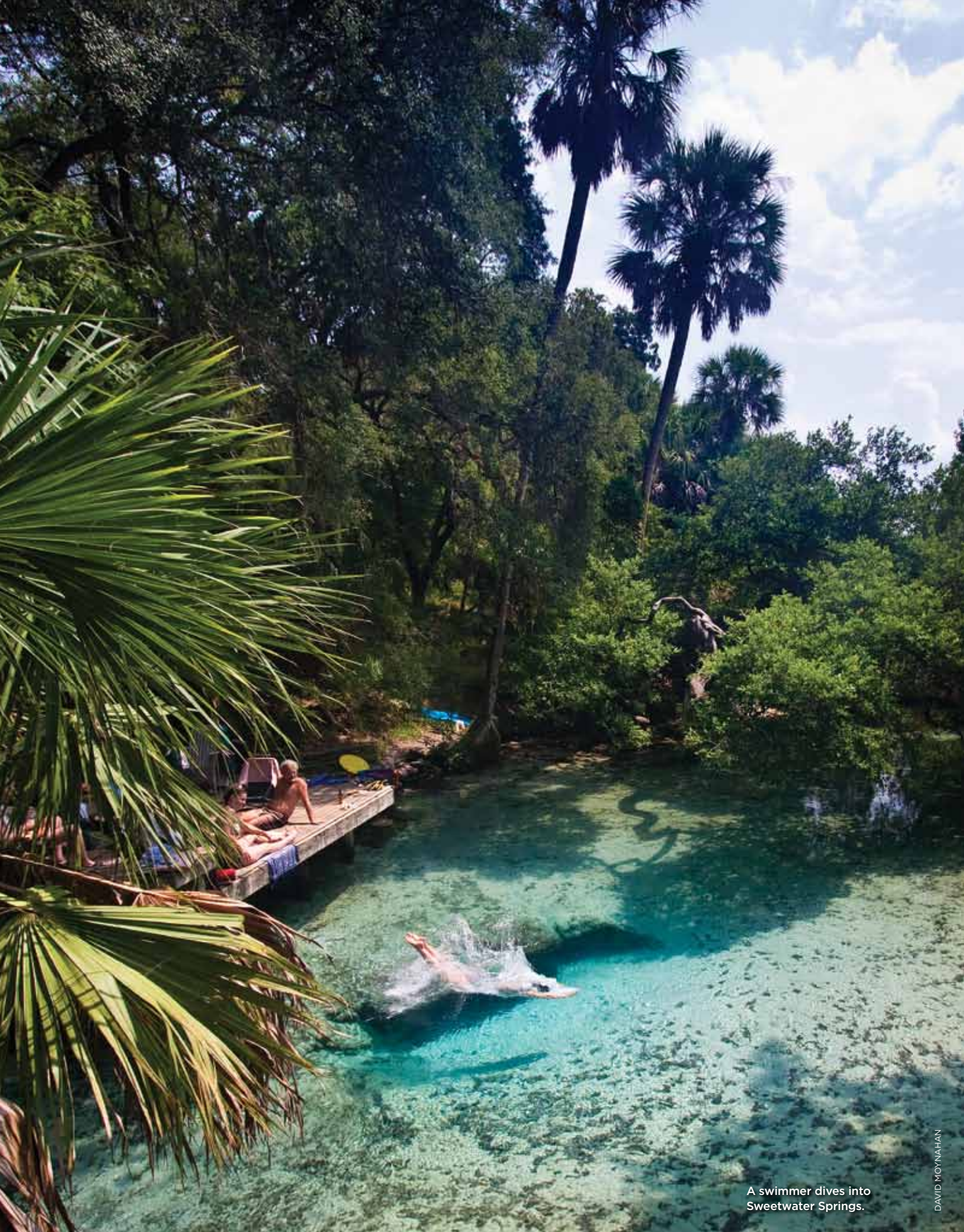
A swimmer dives into Sweetwater Springs.